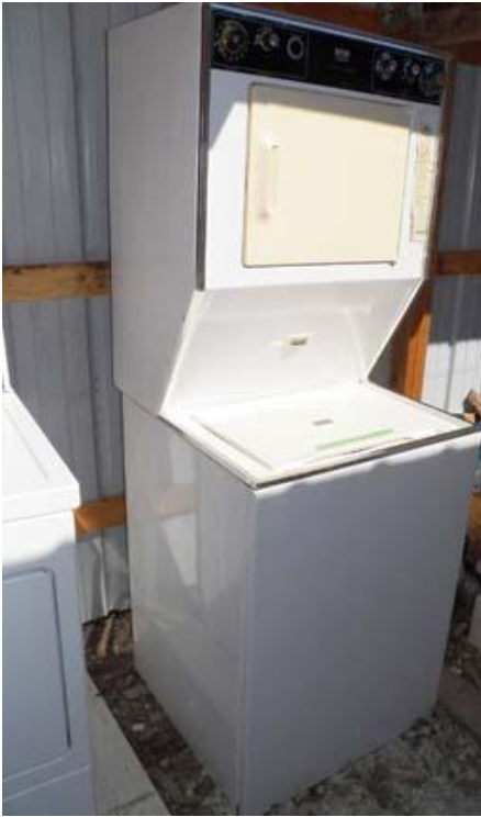
Stacked Washer & Dryer—$100