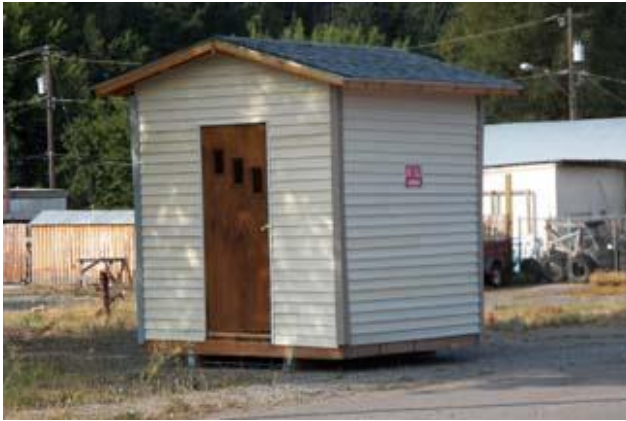
This 8x8 storage shed, built by many hands of visiting youths, is for sale at $960. Projects such as building sheds are great ways for these kids to learn some carpentry skills. Many have never nailed a nail.