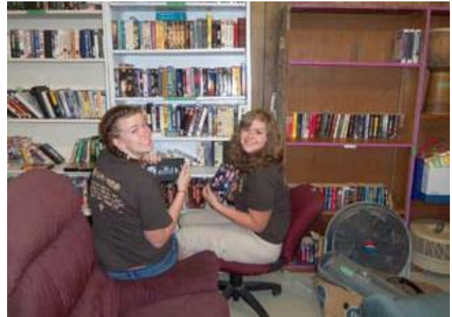
These girls are with the last group of Servant Adventures from Shoshone Mountain Retreat (formerly Shoshone Base Camp) to help this season.

Sept 21—16 th Annual Walk-A-Thon, Registration at 9 AM, Kellogg Middle School