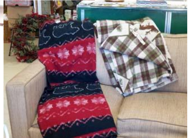
Woolrich Throws —$5