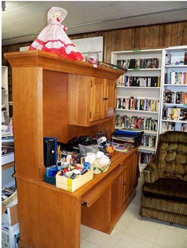
A nice computer desk for sale at $75 loaded with school supplies