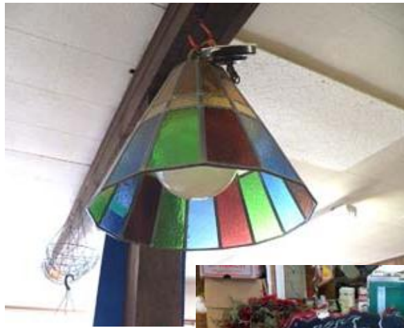
Stained glass hanging lamp—$40