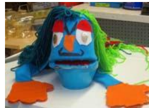
There is a sad little boy looking for this puppet he made and accidentally left at the ReUse Store. If you know him, tell him it is here.