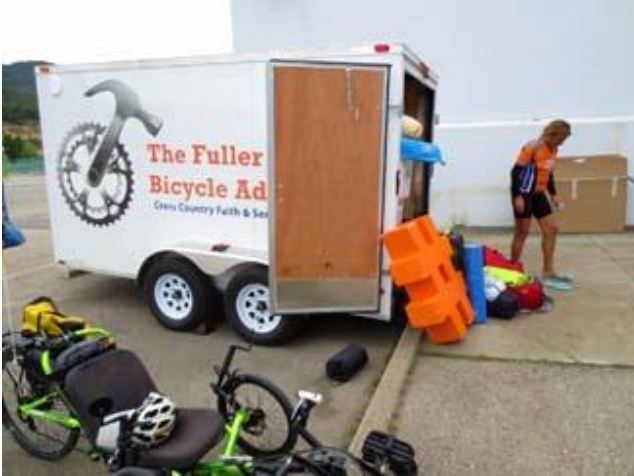
1 st bike support team arrives to get set up at the Kellogg Middle School where they will stay for 3 nights.