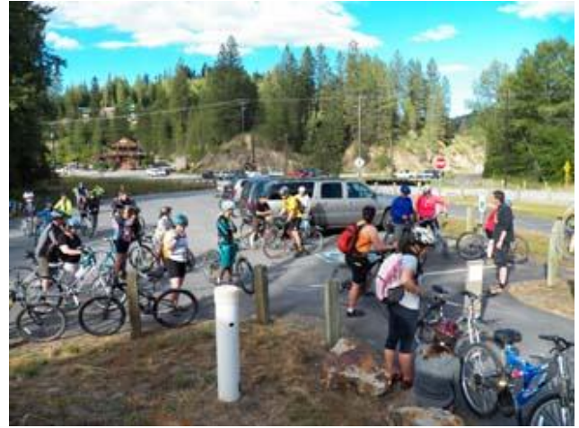
Riders start to assemble at the Enaville Trailhead across from The Snake Pit prior to the start of the Ride the Wall family bike event.