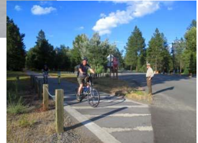
route. One year two ladies missed the turn onto the CCC Road and finally turned around at the weigh station in the canyon.