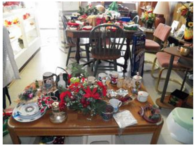
Christmas items at the ReUse Store 75% off until Jan 9.