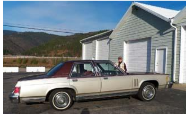
Stacey Douglas shows where to park the 1981 Mercury Grand Marquis donated from the Norma McGatlin Estate. Kellogg Moving & Storage is donating storage space over the winter until we begin the raffle process next spring.