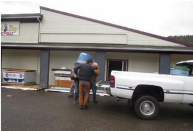
It takes several men to load the heavy blower/hopper for installing insulation borrowed from Kellogg Lumber Co.