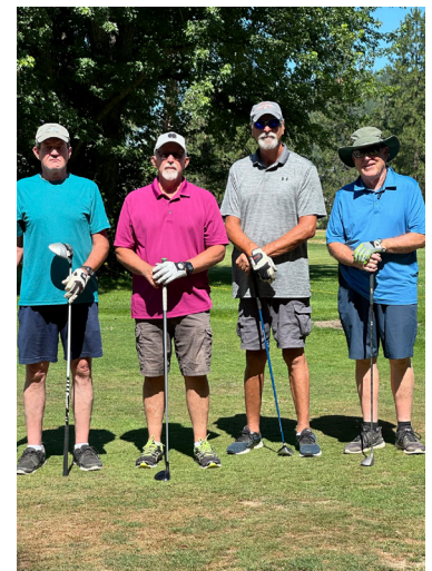
Competitors pose for a picture during the tournament

Finally, all of you be of one mind, having compassion for one another; love as brothers, be tenderhearted, be courteous;