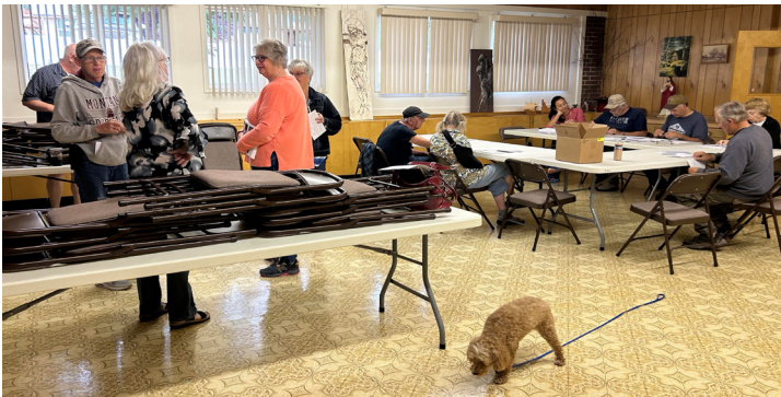
Volunteers at the July newsletter mailing

NON-PROFIT ORG U.S. POSTAGE PAID KELLOGG, ID 83837 PERMIT NO. 54