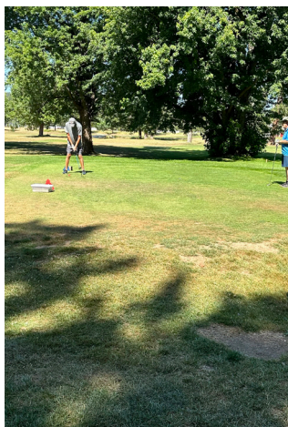
Tournament participants tee off