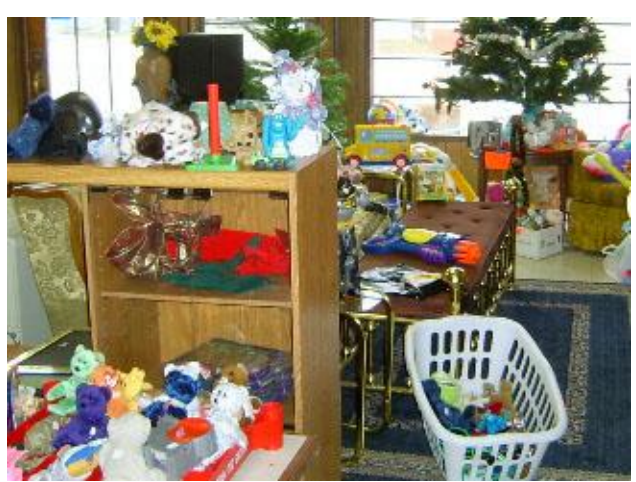
We have a fair selection of toys including teddy bears, beanie (type) babies & Barbie dolls at minimal price.