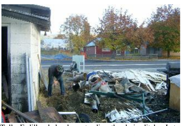
Tully Fedilley helps by extending the drain ditch. Later others including Rick Wood & Verne filled it with gravel. We are working on creating covered space for all the materials stacked in the rear of the ReUse Store.

Volunteers to fill those positions shown with "?" in our roster on page 1.