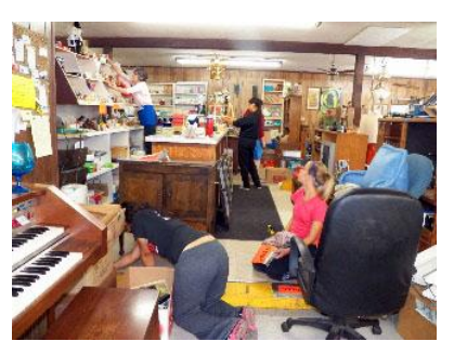
Inside, Pilgrim Lutheran youth help with cleaning, sorting, and displaying the donated items, and installing wall & peg board, etc. Outside, they learn to roof a shed.