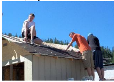
We truly appreciate all the youth labor during the summer.

During the last week of their seven weeks here this summer, Shoshone Base Camp Servants also spent hours helping at the ReUse Store.