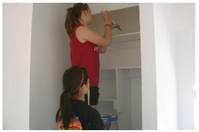
Girls work on a closet.