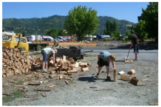
The wood chopping crew tackles a pile behind the ReUse Store. They also sawed up scrap for our fuel this winter.