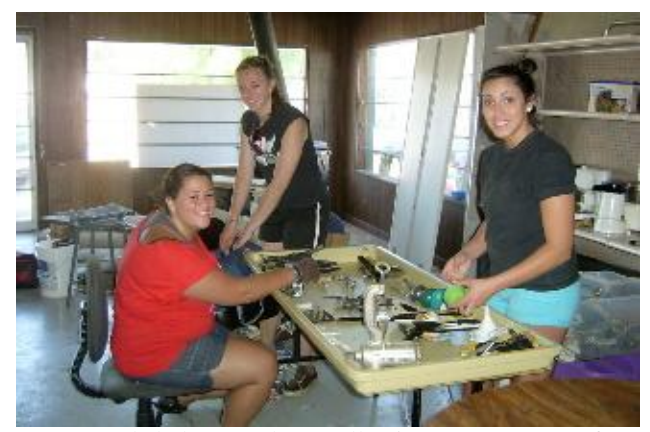
Some youth help sort the smaller items we set out for a sidewalk sale.