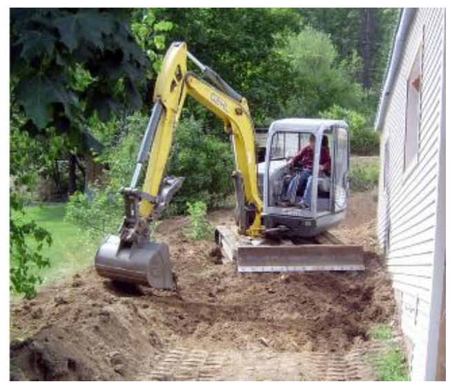
Carl Blalack operates Keith Sims' trackhoe to drain runoff away from the Mullan home.