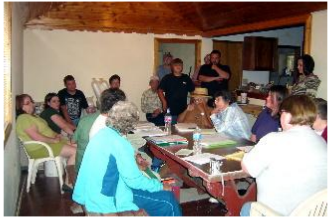
The Partnership & Construction Committees and Board of Directors meet at the Pelham homesite in August.