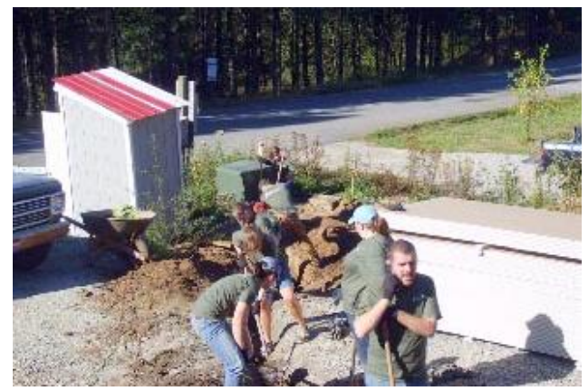
University of Idaho students dig a trench so AVISTA could lay an electrical line to the Lake home.