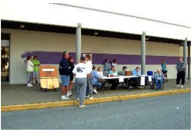
Walkers visit while waiting at the Kellogg Middle School for the start of our 12<sup>Th</sup> Annual Walk-A-Thon