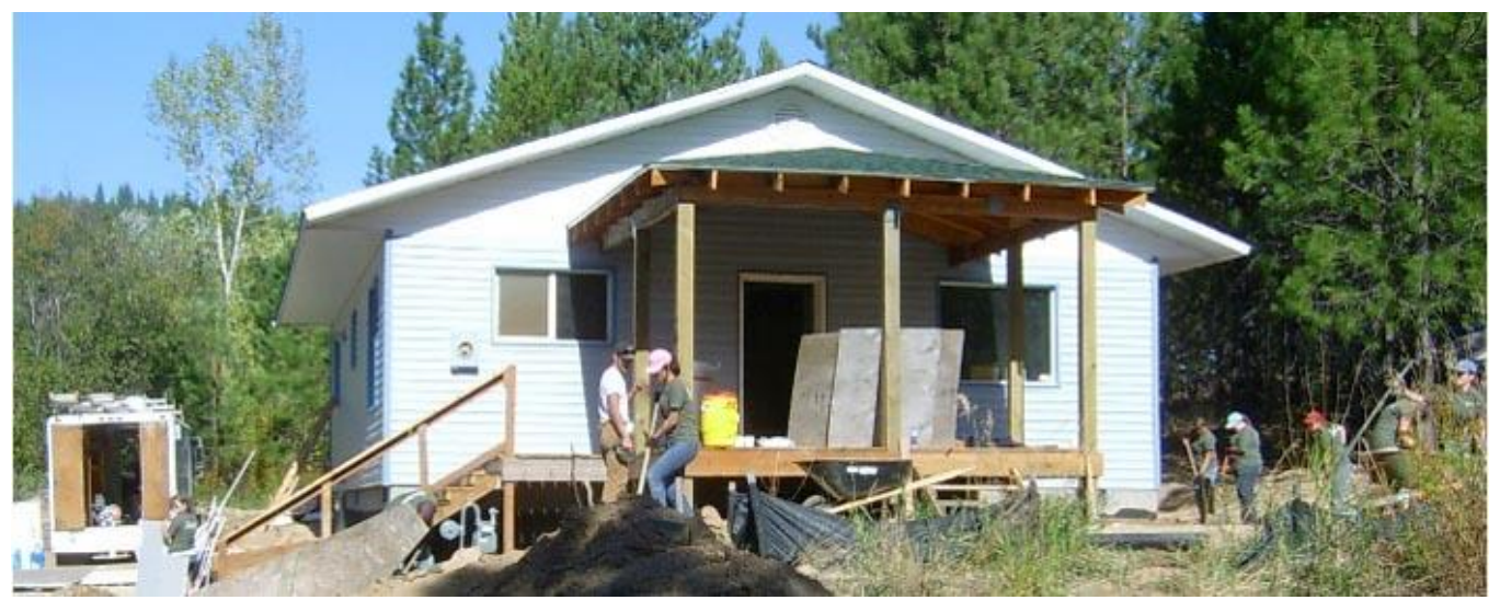
U of I students work measuring wall board at left, digging an electrical trench in front, sloping the soil away from the house at right and installing wall board inside the Lake's family home.