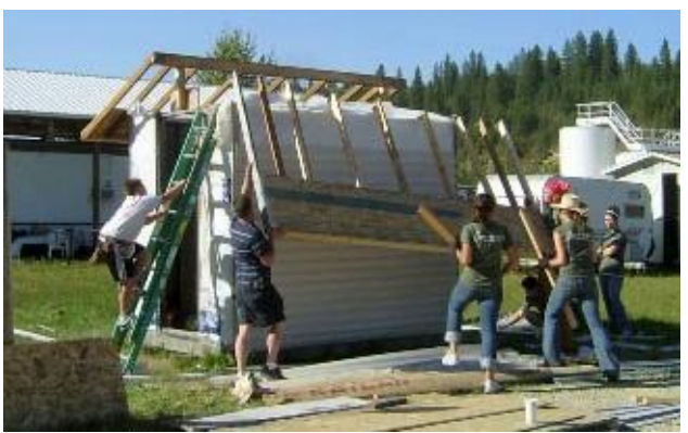
U of I volunteers and Adam Hutchings help roof and side a storage shed with Kevin Hutching's supervision.