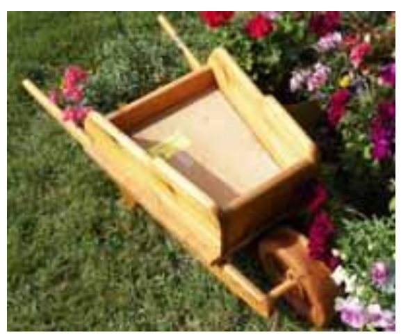
This handcrafted flower garden wheelbarrow donated by Cattails Antiques and Collectables will be included in our Christmas raffle to be held during S V Arts & Craft Fair, Nov 7 & 8. Tickets are available at the ReUse Store.