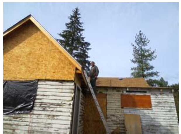
Sam Wiget fixes the roof where the new inline gas water heater is vented.