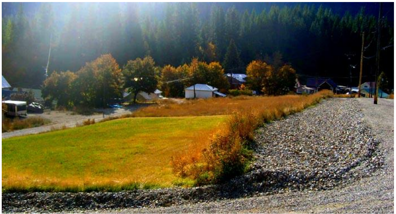
This is the property donated to us by the City of Mullan. We are working with another non-profit, Shoshone County Housing, Inc. who will build one low income home on it. Earlier the Mullan Fire Dept. burned the weeds off and then half was remediated. The wider graveled area along the road will help with snow removal and drainage.