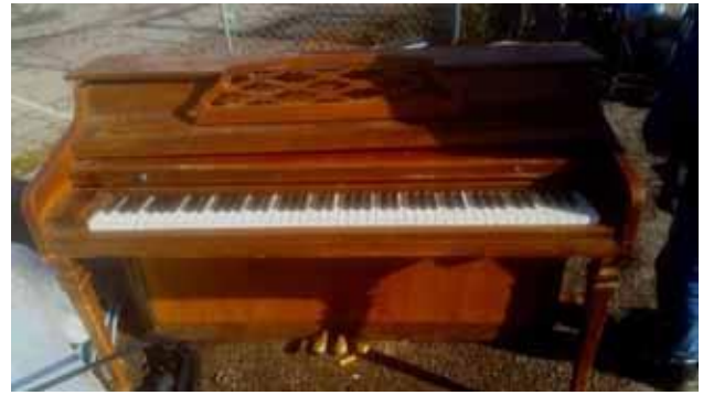
This piano needs a new home. The price is $50 except for schools or churches—then it is free!