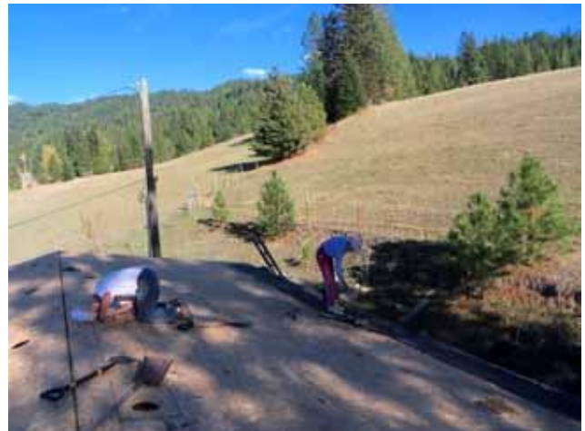
While Shannon Wood removes old shingles at right, Verne uses a flash light inside a vent hole to examine the framing of the manufactured home's roof. The rafters are very narrow, limiting the weight load.