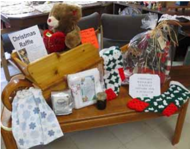
Here are a few of the prizes for our Christmas Raffle to be held at the Silver Valley Arts & Craft Fair, Nov. 7 & 8, at the Silver Hills Elementary School, Osburn. See you there.

The printing of this newsletter is courtesy of ABC Business Equipment 1-208-786-1041 and Supporters Like You