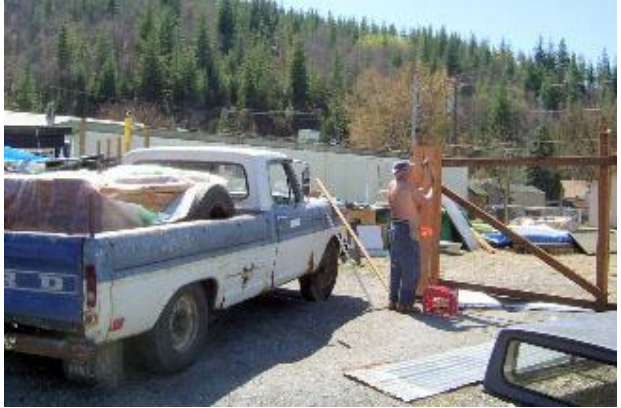
Verne starts nailing the cedar boards to the fence in back of the ReUse Store. He herded "Old Blue" carefully with 2400 lb of lumber on it. We need volunteers to help with projects like this outside as well as help in the store.