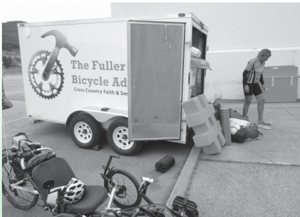
1st bike support team arrives to get set up at the Kellogg Middle School where they stayed for 3 nights in 2016 during their trip to the Silver Valley

When I stumbled upon the Fuller Center Bike Adventure website almost two years ago, I had no idea of the profound effect that it would have on my life. As the communications and media specialist for the cross-country summer trip, I have been allowed to accompany the adventure in order to document everything: the cycling, the laughs, the home-building, the camaraderie, and the passion that overtakes us all as we work daily to reach our goals.