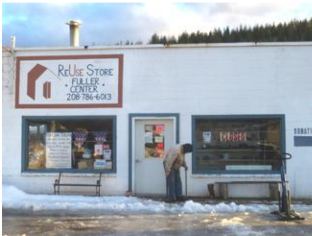
Verne hacks at the ice in front of the ReUse Store while it was closed due to the extremely slick glaze of ice. While the store was closed, he cleaned the chimney and replaced the cap with the crumpled trash can lid after it was caught in “old Blue” when Verne spun off I-90. Fortunately nothing was hurt except the new trash can. Our thanks to the Pinehurst Fire Dept. for use of their chimney brush.