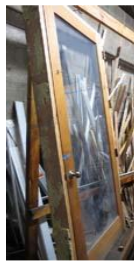
This very nice 8 foot tall door complete with casing, jam and hinges is for sale at the ReUse Store for only $50.