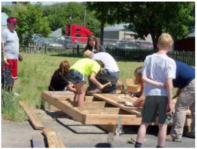
Holy Family Catholic School youth learn how to pound nails while building the floors for sheds.