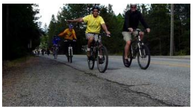
Garrett Thyr selected this frame from the video he made of the bikers turning onto the CCC Road just after crossing the bridge at Cataldo.