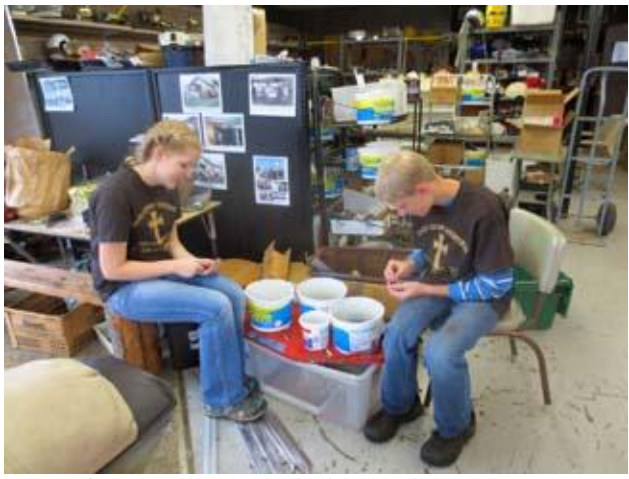
Others found work to do inside sorting screws, bolts & nails.