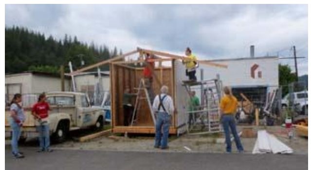
Idaho Servant Adventurers from Minnesota, who stayed up the river at the Shoshone Mountain Retreat, spent four days working on projects around our community. This group is learning some carpentry skills while building a shed that we can sell at the ReUse Store.