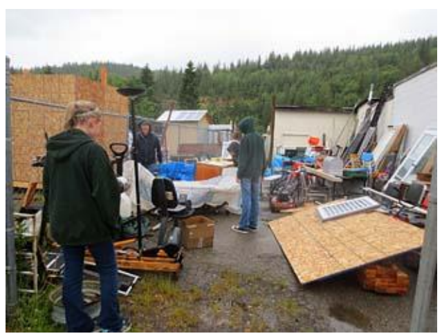
Some of our first group from Shoshone Mountain Retreat, these were from Washington, had very wet weather to work in.