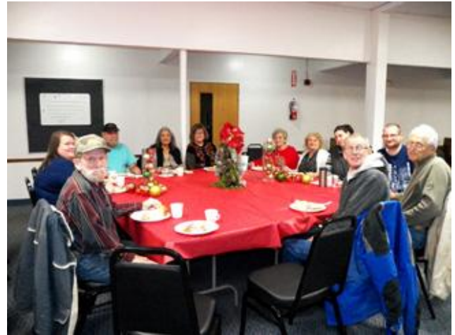
Board members, family, and friends join around an expanded table to enjoy to great food and fellowship at the annual Christmas Potluck.