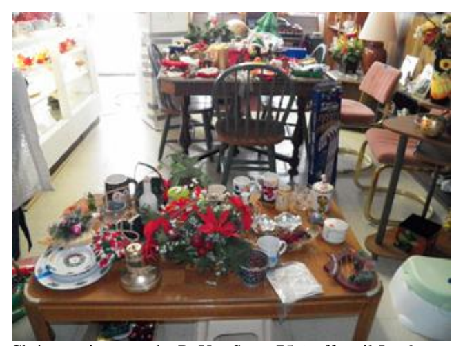
Christmas items at the ReUse Store 75% off until Jan 9.