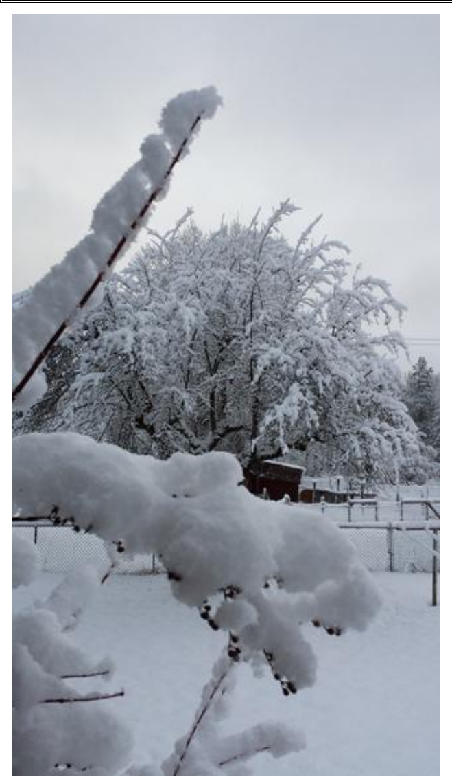
Happy New Year 2016 May we all start the New Year with positive thoughts and actions that continue all year long. When you help others, it is good for you, too.