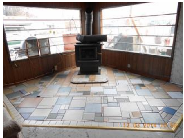
We were delighted when Kim Short decided to replace the shaggy carpet around the wood stove at the ReUse Store with tile. Her husband, Shorty, did help some even surviving catching the falling stove pipe on his head.