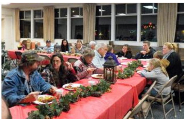
A nice group of well wishers came together to enjoy the dinner.