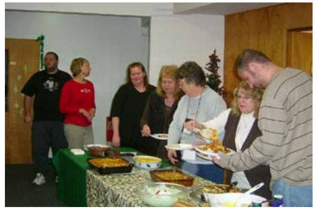
There was plenty of food available at the Christmas potluck.