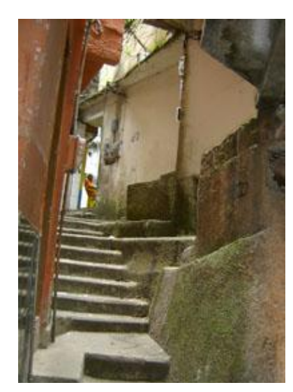
This narrow way had a "street name" & house numbers.

especially on the outskirts of Rio where newcomers use scrap materials for homes. As workers get richer and are unable to move to the flat areas, they reinvest their money in their favela community. Regardless of wealth, most favela dwellers have a million dollar view, looking down a valley, across a flat valley to a tropical sandy beach available to everyone.