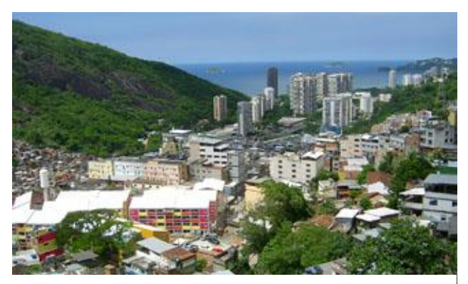
The million $ view of the resorts and lovely bay.

As Rio has some international events coming in the near future including the next Olympics, the government is attempting to make the favelas less of an eyesore in a relatively short time. Amazingly, the thousands of dwellings consist of many smaller communities, the richer ones complete with schools, churches, medical facilities, community centers, etc. The poorer ones have sewer challenges, drug gang wars, etc.,