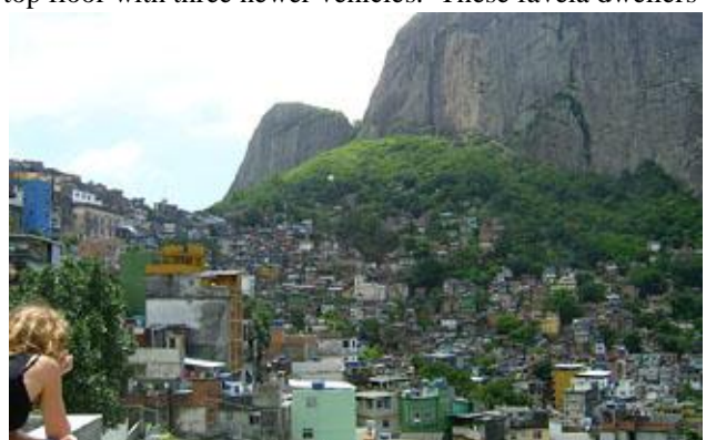
View of the 2<sup>nd</sup> favela from the balcony of a 7-story building with tiled walls. The government has taken an active role in civic improvements here.

The workers of Rio live in the "favelas", some of which are adjacent to the industrial areas near the docks and the rest on the steep granite slopes. As the first workers could not afford to live in the flats, they squatted on the hillsides adjacent to the rich upper class flatlanders. Later arriving workers built behind the original squatters. Today the steep slopes are covered with worker housing. Contrary to my expectations, the favelas aren't just slums with flimsy shacks. They are mostly masonry buildings. We were in a seven story one complete with a garage on the top floor with three newer vehicles. These favela dwellers