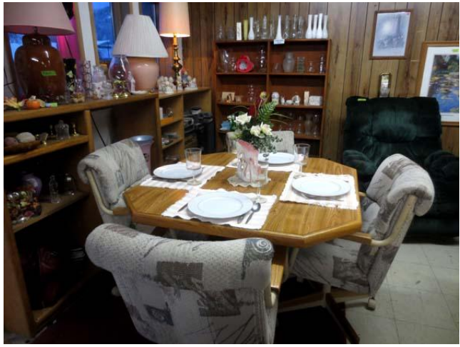
A fellow bought this table and chairs that were listed on the Silver Valley Classifieds but did not pick up the table leaf that went with it. If you know him, please let him know it is at the ReUse Store.