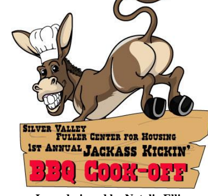
Logo designed by Natalie Ellis

❖ Finally Step 5 Get those creative juices flowing and come up with a good BBQ slogan. GOT THAT!!