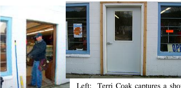
Left: Terri Coak captures a shot of Kerry Sawyer of Shoshone

Glass as he cleans out the broken door frame of our "art deco" front door. Above is our new insulated, inward swinging front door that Kerry installed. The old glass door that blew out across the sidewalk is still available for sale; it needs new hinges. ©