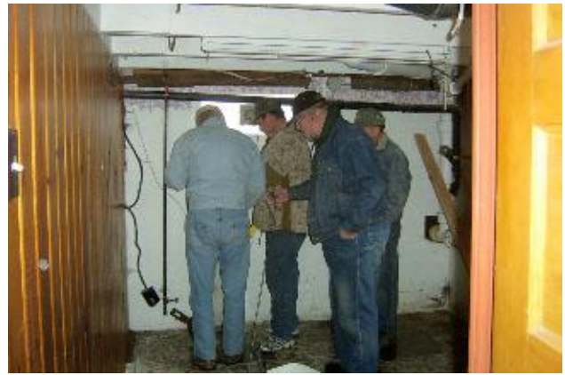
It must be a “teachable moment” in the laundry room at the Kreideman home site in Smeltonville.