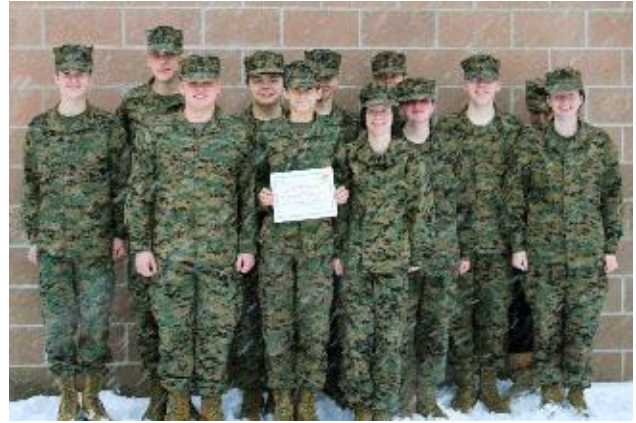
Kellogg High School JROTC shows off their appreciation certificate for helping each year with the "Bike the Wall" event and occasionally at the construction sites.