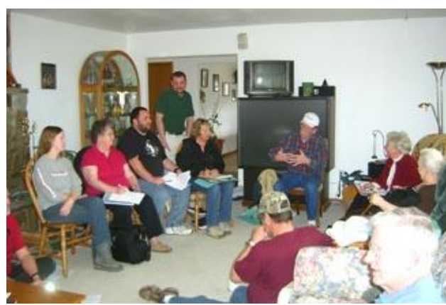
Discussions centered on our usual home building projects as well as our new ventures into Greater Blessing projects during the Board retreat in March.