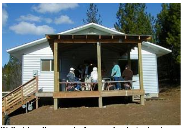
Well wishers linger on the front porch enjoying lovely weather for the dedication of the Lake home.