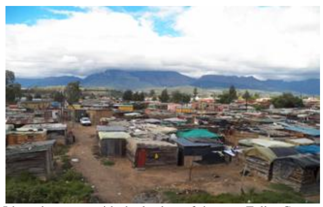
I hoped to meet with the leaders of the new Fuller Center group in South Africa during my recent trip, but they were in the US while I was there. Here is a photo of some shanties made with any available materials. A local told me that whenever someone moved to a nicer home, they immediately rented their old shack to another desperate family.